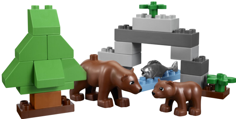
Suggested model solution