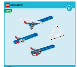
Principle models building instructions booklet for gears and levers